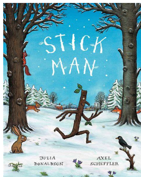
Stick Man by Julia Donaldson