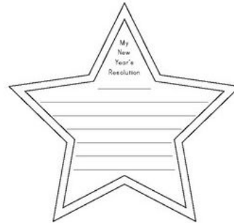
New Year's Resolution Stars