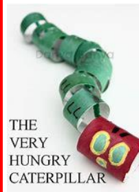
THE VERY HUNGRY CATERPILLAR

We will be reading the story of The Very Hungry Caterpillar . Can you make your own caterpillar or butterfly?